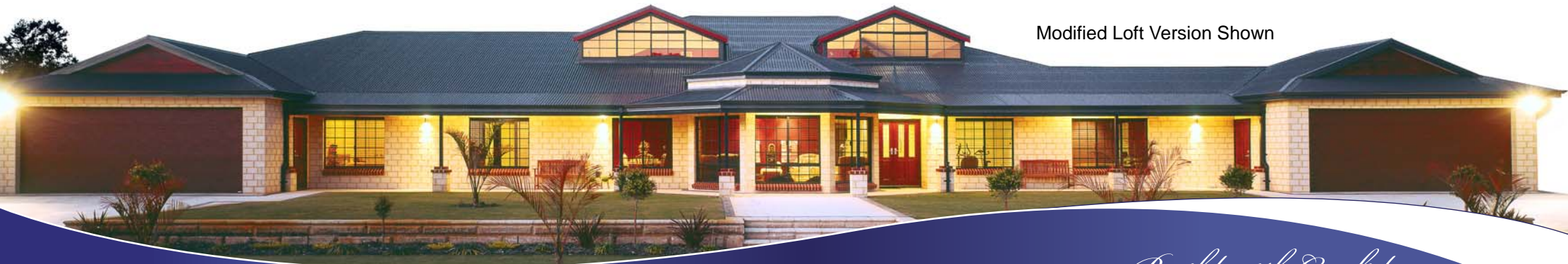
Modified Loft Version Shown